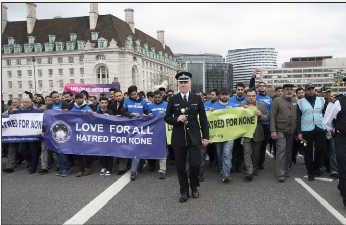
Solidarity walk on Westminster Bridge, London, in 2017, in the aftermath of the terrorist attack.

The Ahmadiyya Muslim Community conducts national campaigns against extremism and stands in solidarity with all victims of extremist attacks.